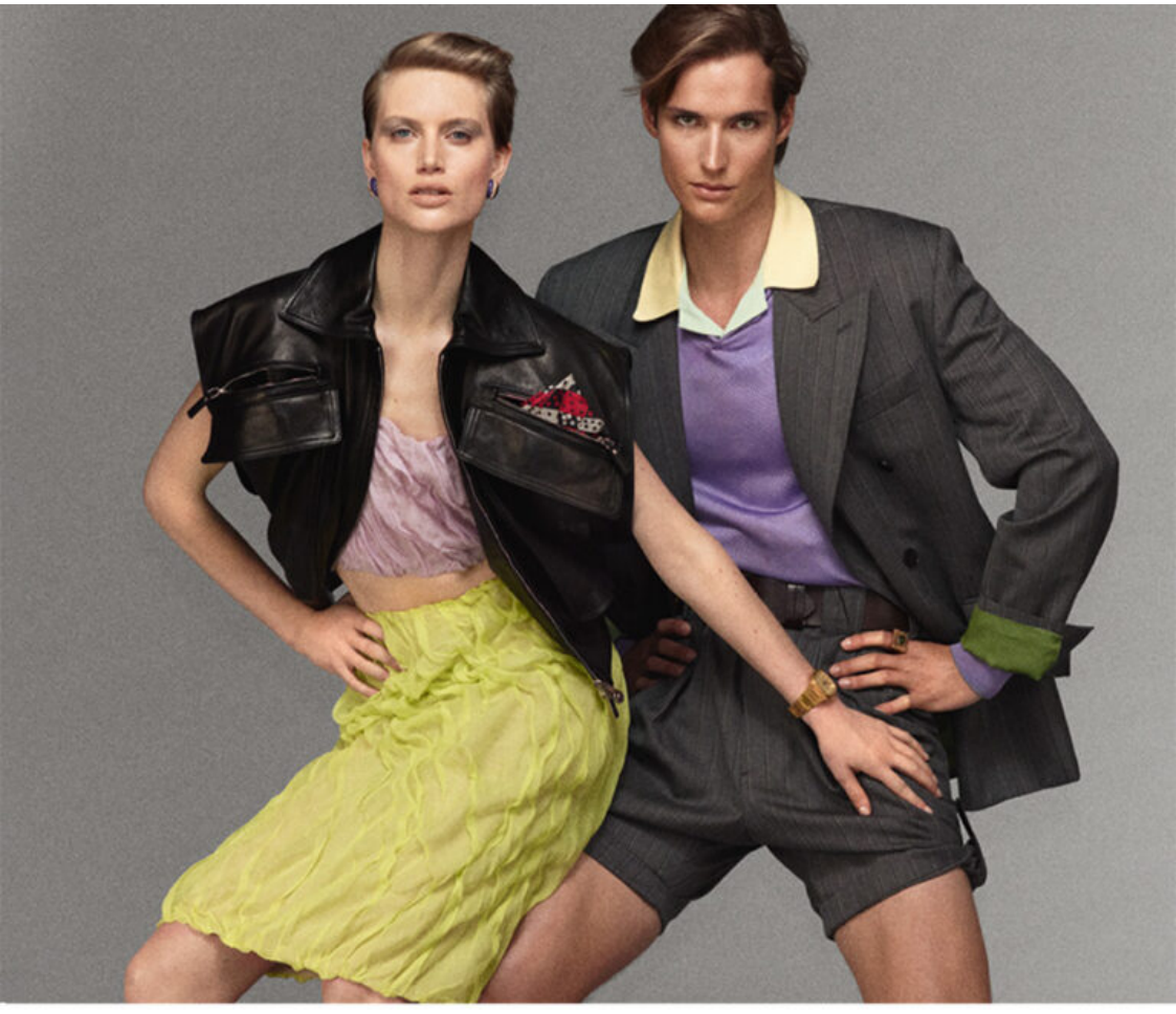
Vest, top and skirt by Versace , scarf by Charvet , vintage earrings and watch from Dary's. Right: Jacket, polo, shirt, shorts, belt, ring by Versace .