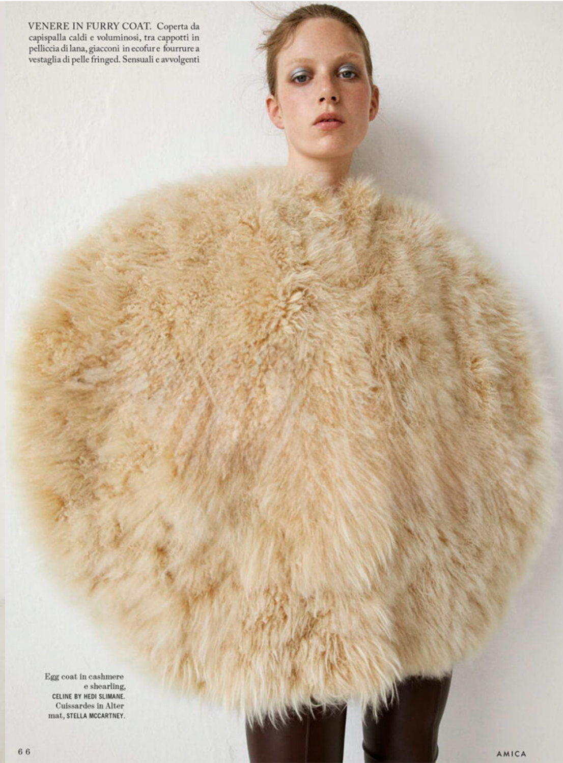
Egg coat in cashmere e shearling, CELINE BY HEDI SLIMANE. Cuisseardes in Alter mat, STELLA MCCARTNEY.