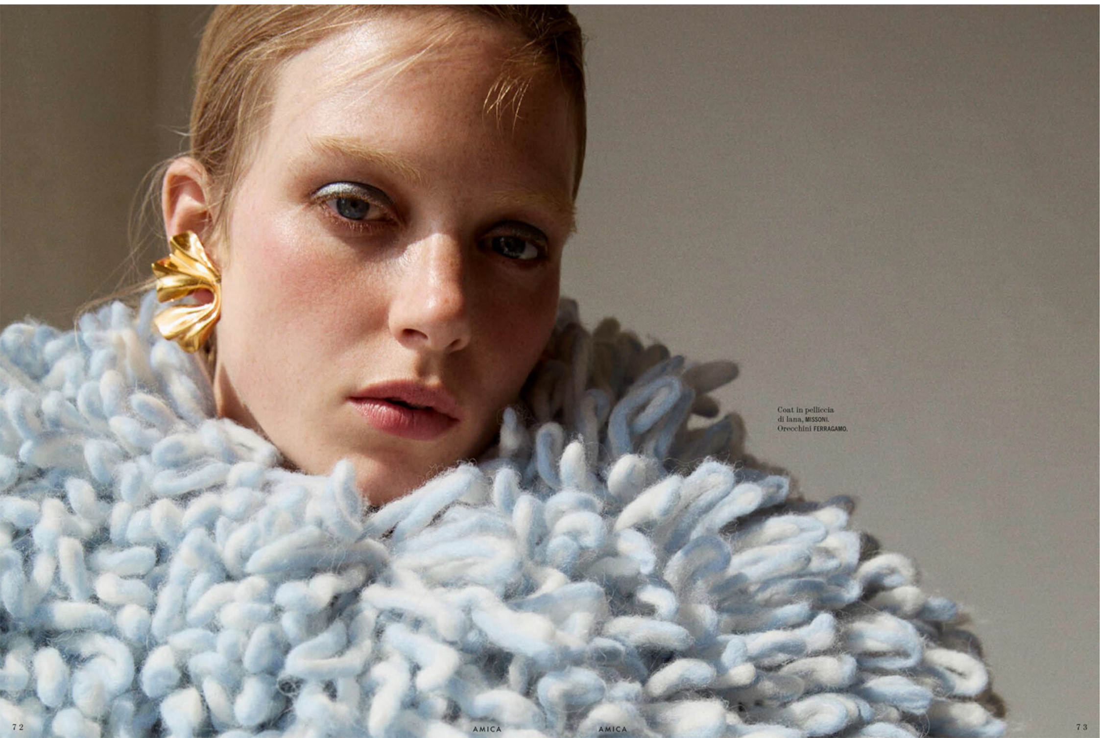
Coat in pelliccia di lana, MISSONI. Orecchini FERRAGAMO.